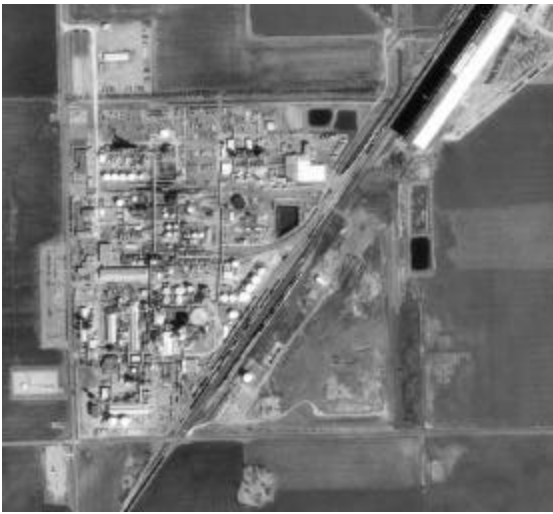
Overhead View of Vulcan – 1999